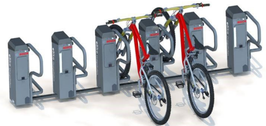
Ground Mount option shown